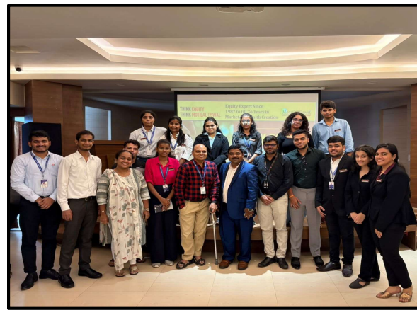
Glimpses of Stock Market Awareness Seminar